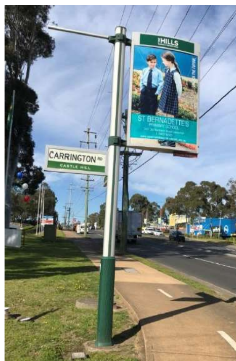
Figure 2: Example of advertising on street signs