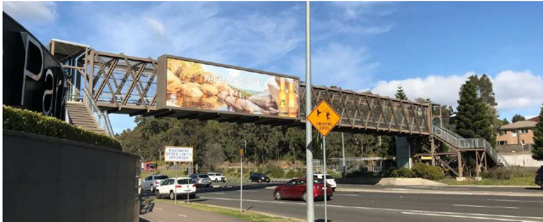
Figure 3: Example of advertising on bridge